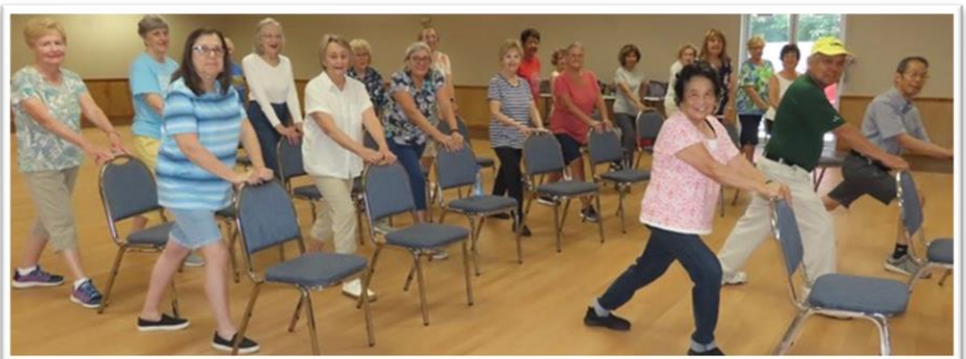
Participants exercising in a Project Healthy Bones Class from Randolph, NJ (2023)